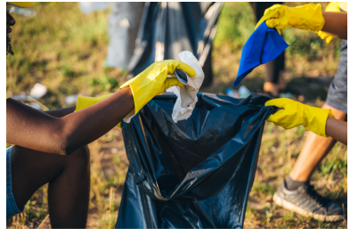
Columbia Cleans Day! (More info on Flyer)